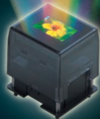
OLED Multifunction Switches & Displays